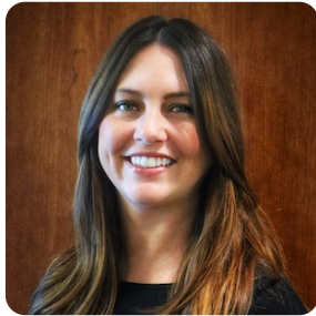
Krickett Racca Arts & Humanities Council