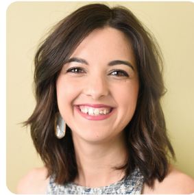
KARI CASEY Children's Museum